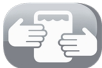
Removable water reservoir