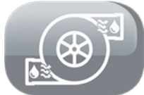
Built-in drain pump